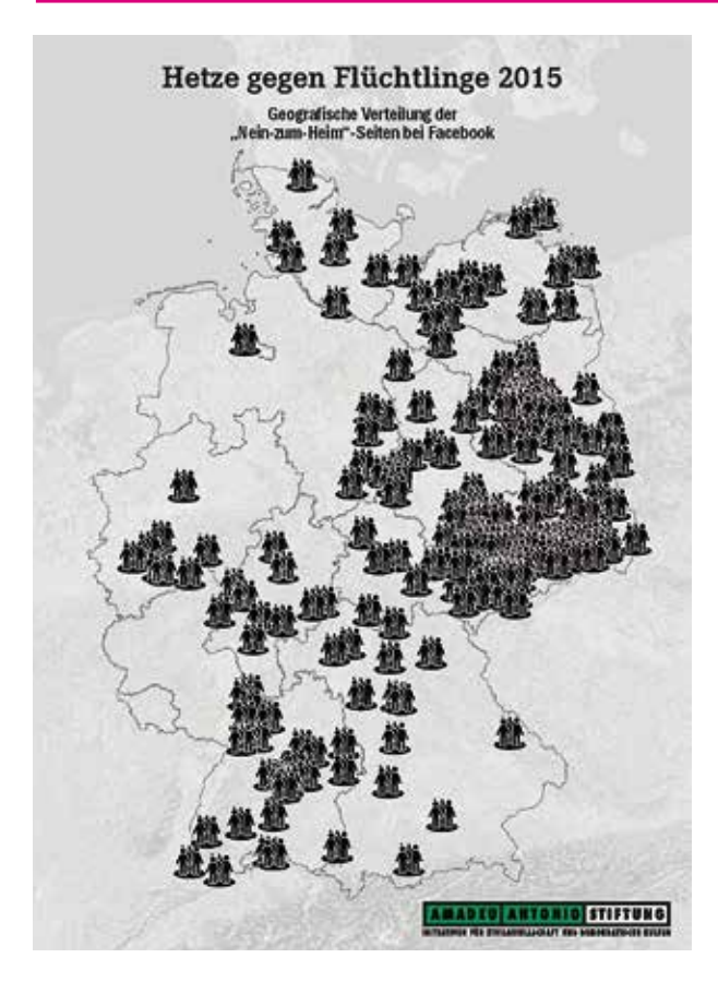
Hate speech against refugees in 2015 Geographical distribution of "No to Homes" pages on Facebook

If you encounter topic-hopping (many different topics are being addressed all at once) by your interlocutor, you should guide the participants in the conversation onto a single issue, and also communicate this ("You've addressed many issues now, but I'd like to discuss just this particular one with you here, e.g. the racist aspect"). It may also prove helpful in regard to debates concerning migration to remain substantively focused on the topics of human rights und equality, instead of beginning utilitarian discourses about "good" and "bad" migrants. Other attempts at distraction aimed at disrupting the discussion should be addressed and exposed. Demand rules of discussion, since anyone wishing for a serious debate will accede to this.